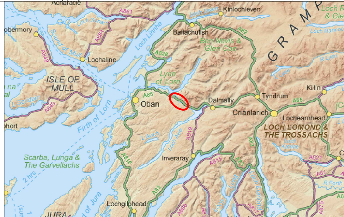
GENERAL AREA - NOT TO SCALE